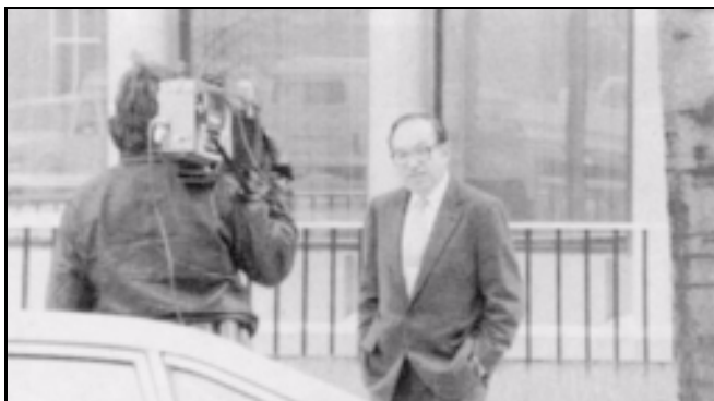
Raul Hilberg during the Zündel trial in Toronto 1985